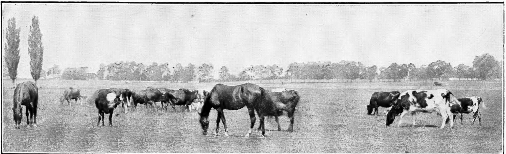
HENDERSON'S PERMANENT PASTURE DEVELOPS CONTENTED CATTLE